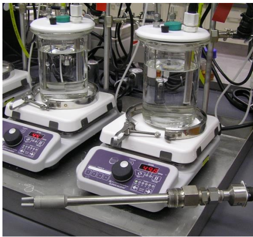
Figure 1: Photo of bubble test apparatus

Figure 1 shows a photo of a typical bubble test apparatus. The test vessel hosts fluids and electrodes (reference, working, and counter) as well as the gas bubbling tube and the temperature controller. It sits on a magnetic stir mantle and is normally wrapped with heat tape to operate at a given temperature range. As shown, and because of glassware arrangement, the bubble test is typically operated at ambient pressure and temperatures below boiling point.