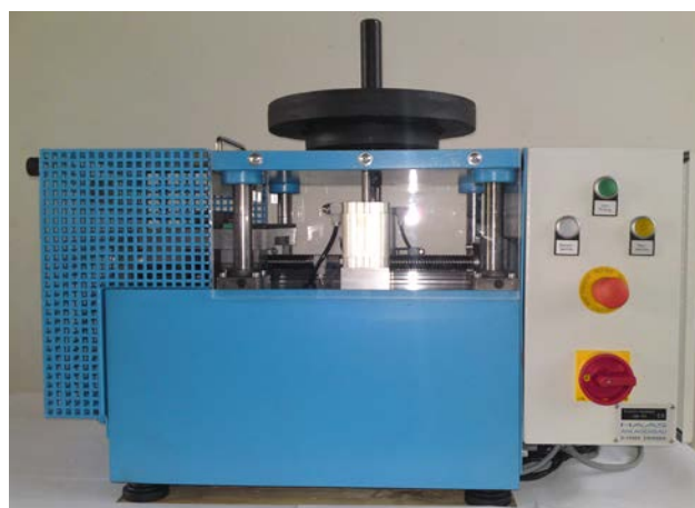
Figure 2: Example of a Gouge Tester